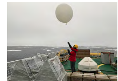
Radiosonde launched at RV ARAON