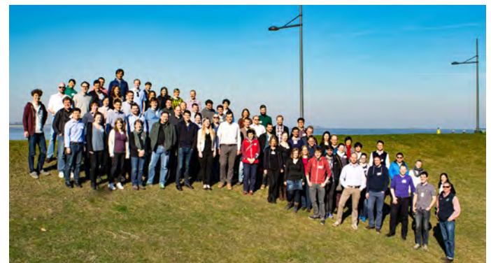
On the sunny side of Bremerhaven Deich: Participants of the Polar Prediction Workshop 2017

13 Polar Prediction Workshop | From 27 to 30 March 2017, the 4th Polar Prediction Workshop was held at the German Maritime Museum (Deutsches Schifffahrtsmuseum) in Bremerhaven, Germany. The Polar Climate Predictability Initiative (WCRP-PCPI), the Polar Prediction Project (WWRP-PPP), the Sea Ice Prediction Network (SIPN), and the Sea Ice Model Intercomparison Project (SIMIP) were pleased to welcome about 80 international sea-ice experts who discussed environmental prediction capabilities in the polar regions on subseasonal to interannual timescales, thereby helping to build a “seamless” polar prediction community.