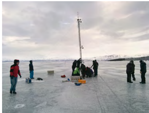
Hands-on: Students setting up a weather mast on a frozen lake near Abisko Research Station as part of the first Polar Prediction School

This school will include a combination of polar weather and climate theory lectures with exercises on modelling and field meteorology techniques as well as soft skill training. Each of