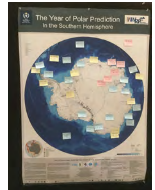
For better overview: YOPP-SH#2 workshop participants added their national contributions on post-its to an Antarctic map

Contact: David Bromwich bromwich.1@osu.edu