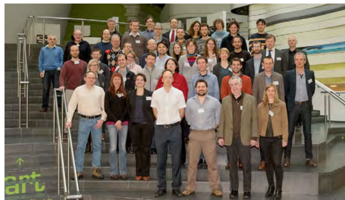
Teaming up: APPLICATE kick-off at Bremerhaven Klimahaus

The YOPP-endorsed project APPLICATE ( http://applycate.eu ) officially launched on 8–9 February when delegates from the 16 partner institutions met in Bremerhaven, Germany, to discuss their collaborative efforts to improve climate and weather prediction for the Arctic and the mid-latitudes. The EU-Horizon 2020 project APPLICATE is receiving funding of €8M for four years of