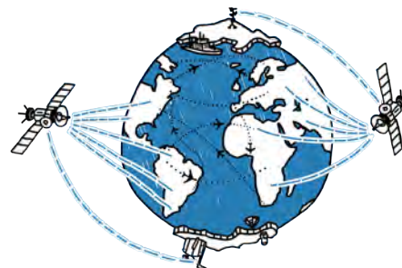
What is YOPP: Video animation released at YOPP launch on 15 May ( video on YOPP YouTube channel)

Two new videos available via the YOPP YouTube Channel introduce the topic of polar prediction to the public: a video animation jointly produced by ICO, WMO and AWI explains the Year of Polar Prediction in five minutes. In a second video experts from operational centres and research institutes personally explain what the Year of Polar Prediction means to them.