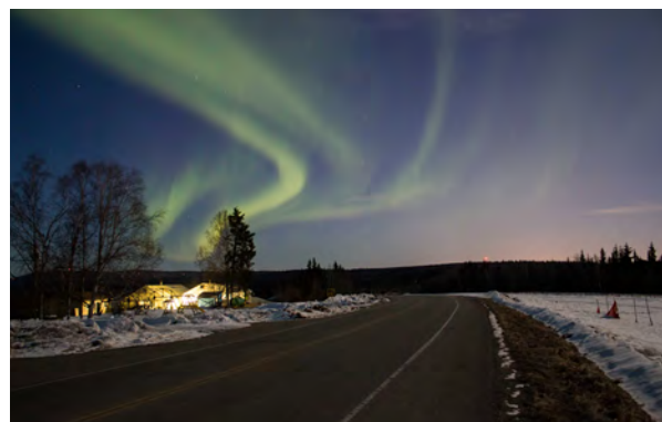
Beautiful Arctic: Northern lights during the April PPP-SERA meeting in Fairbanks, Alaska