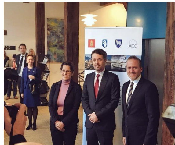
His Royal Highness the Crown Prince of Denmark, Ms. Suka K. Frederiksen, Minister of Independence, Foreign Affairs and Agriculture, Greenland, and Mr. Anders Samuelsen, Minister for Foreign Affairs of the Kingdom of Denmark, before the Conference.

The Conference addressed in particular the economic dimension with a strong focus on the role of the private sector and private-public partnerships, the role of the Arctic Council and the Arctic Economic Council, the need for more investments in the Arctic, inclusion of indigenous peoples, and continued local and international cooperation in the region.